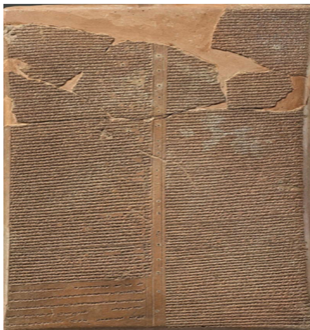
Figure 3. The Sargon tablet housed in the Louvre Museum (British Museum, K.1675; Frame, 2014).