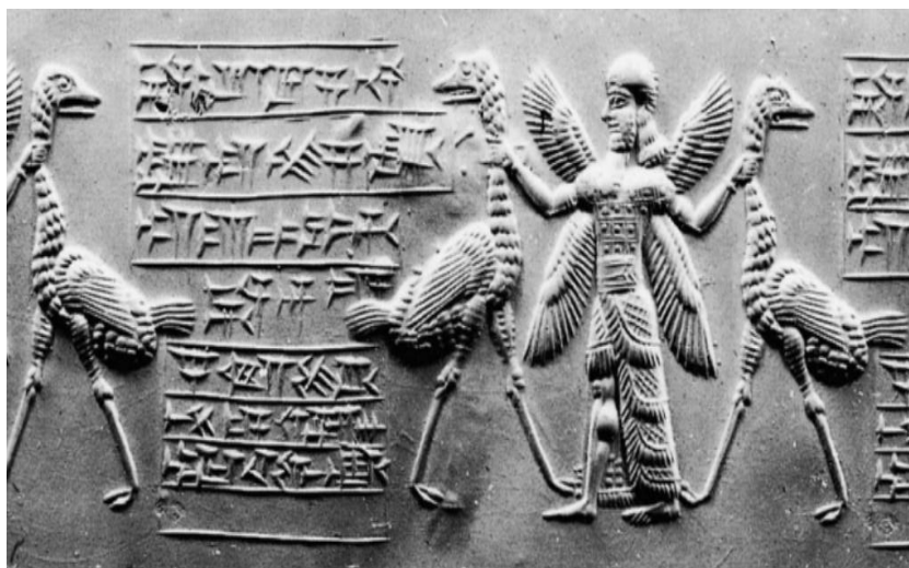
Figure 4. Cylinder seal impression belonging to Urzana (Radner, 2012, Fig. 17.02).

Although the region's harsh geographical conditions made Mušašir a difficult target for Assyrian conquest, Sargon II's campaign granted Assyria a decisive advantage at a time when Urartu had been weakened by Cimmerian incursions from the north (Radner, 2012). In this context, Mušašir emerged not only as a religious center but also as a key political focal point in the ongoing struggle between Assyria and Urartu.