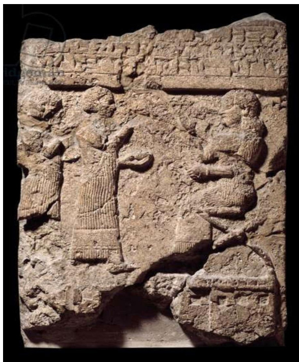
Figure 1. Fragment from the relief depicting the plunder of the Temple of Mušašir (Louvre Museum, AO 19873; Albenda, 1986).