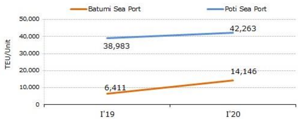
Scheme 4:The amount of containers processed in harbours.

Batumi seaport is an important knot of our trasportation system and also for European corridor.It is international large-scaled transportation object, which has container terminal and boat-passage ervice for the service of ferries, dry cargo terminal, passenger terminal and Batumi oil-terminal <sup>15</sup>;